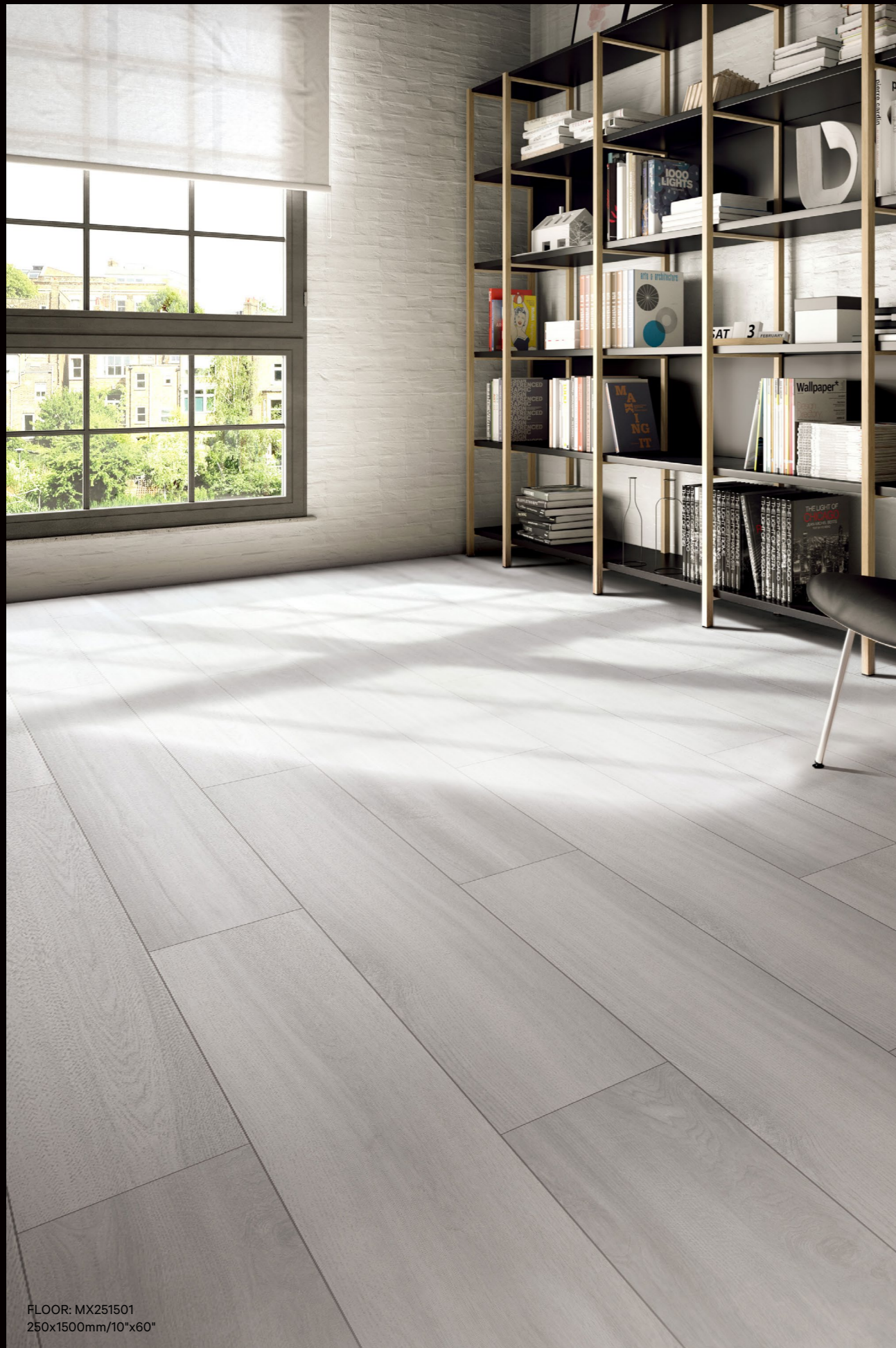
FLOOR: MX251501 250x1500mm/10"x60"