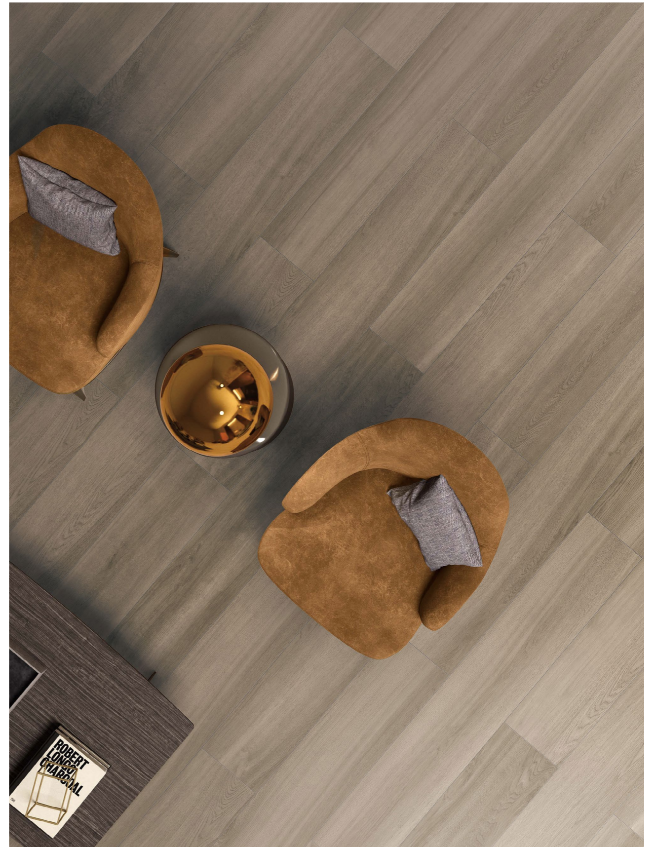
FLOOR: MX251502 250x1500mm/10"x60"